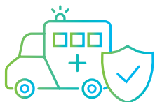
Protection from unexpected health-related costs