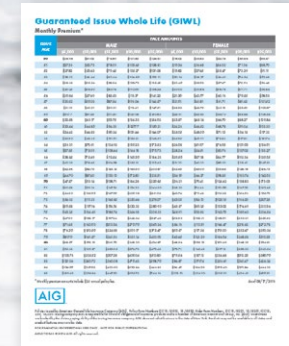
Monthly Rate Card